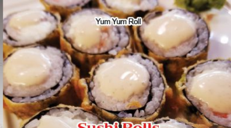
Yum Yum Roll