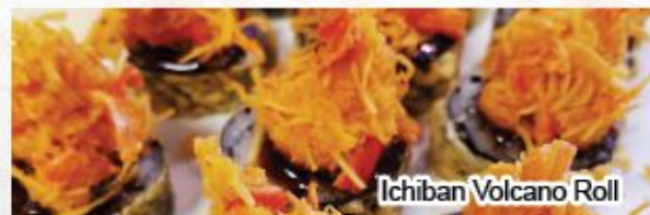
Ichiban Volcano Roll