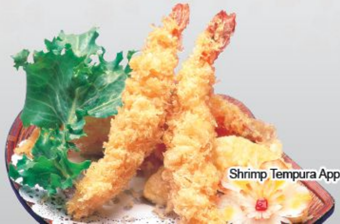
Shrimp Tempura App