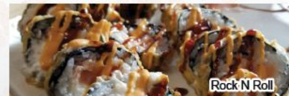
Rock N Roll