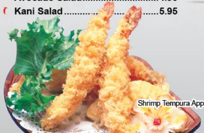
Shrimp Tempura App