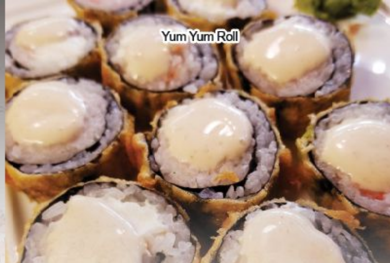
Yum Yum Roll