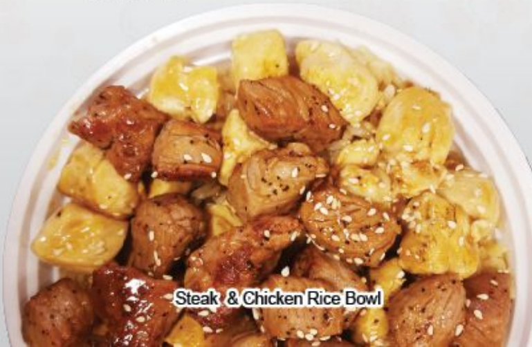
Steak & Chicken Rice Bowl

NOTE: CONSUMING RAW OR UNDERCOOKED MEATS, SEAFOOD, SHELLFISH, BEEF, OR EGG MAY INCREASE YOUR RISK OF FOODBORNE ILLNESS. BEFORE PLACING YOUR ORDER, PLEASE INFORM YOUR SERVER IF A PERSON IN YOUR PARTY HAS A FOOD ALLERGY.