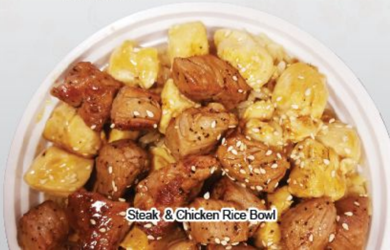
Steak & Chicken Rice Bowl

NOTE: CONSUMING RAW OR UNDERCOOKED MEATS, SEAFOOD, SHELLFISH, BEEF, OR EGG MAY INCREASE YOUR RISK OF FOODBORNE ILLNESS. BEFORE PLACING YOUR ORDER, PLEASE INFORM YOUR SERVER IF A PERSON IN YOUR PARTY HAS A FOOD ALLERGY.