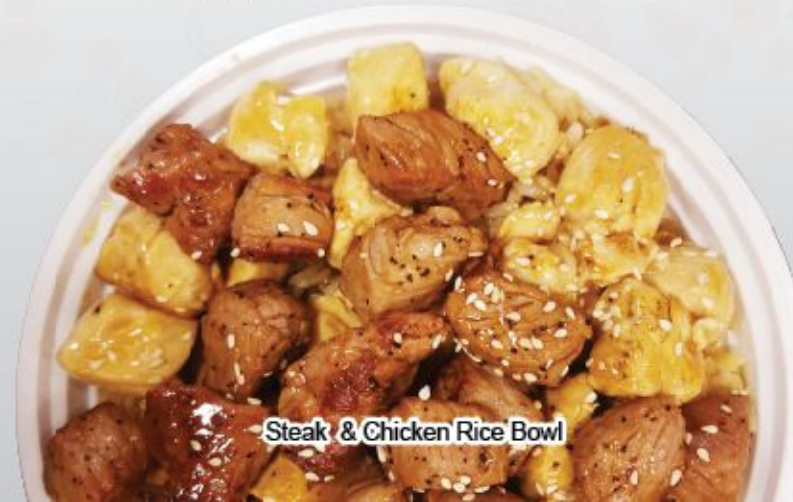
Steak & Chicken Rice Bowl

NOTE: CONSUMING RAW OR UNDERCOOKED MEATS, SEAFOOD, SHELLFISH, BEEF, OR EGG MAY INCREASE YOUR RISK OF FOODBORNE ILLNESS. BEFORE PLACING YOUR ORDER, PLEASE INFORM YOUR SERVER IF A PERSON IN YOUR PARTY HAS A FOOD ALLERGY.