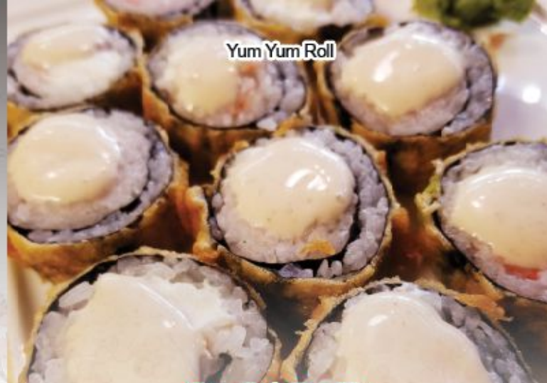
Yum Yum Roll